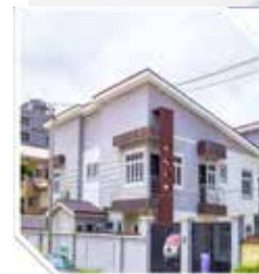
ASHER COURT, V.I (8 numbers town houses)