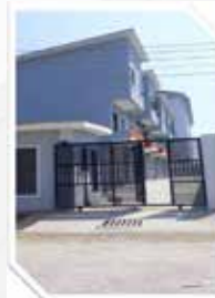
EL-SHADDAICOURT, AGUNGI (5 numbers block of flat)