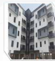
EL COURT, BANANA ISLAND (8 numbers flats + pent floor)