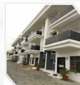
TOFARATI COURT, ONIRU (4 numbers town houses)