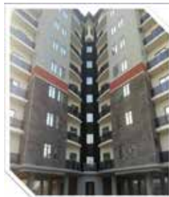
VANTAGE COURT, V.I (14 numbers three bedroom flats + 2 pent floors)