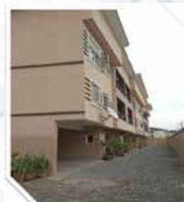
ESKOR MEWS, V.I (6 numbers town houses)