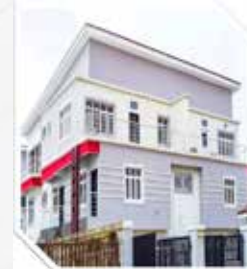
ADE COURT, V.I (8 numbers town houses)