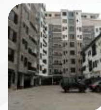
FABIAN COURT, IKOYI (26 Luxurious Flats + 3 Pent floor)