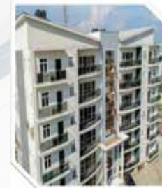
PROVIDENCE COURT, V.I (12 Luxurious flats)